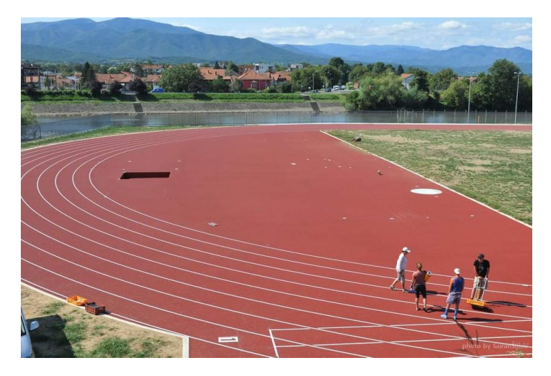
Going to the Stadium for training and competition