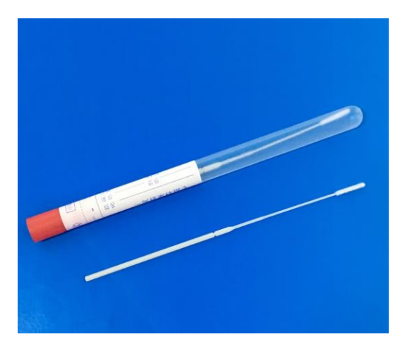
Swab collection to be done 48 hours before arrival (result to be in English)