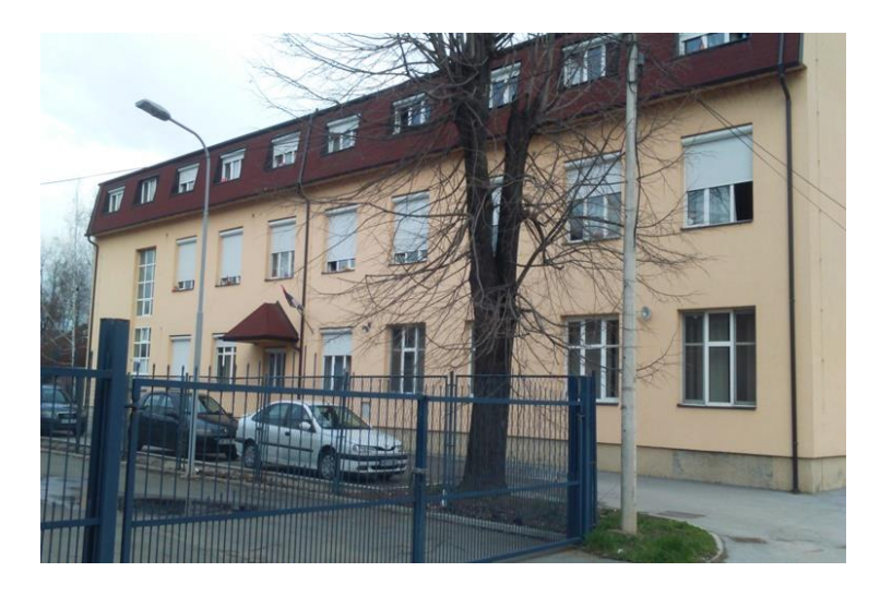
Going back to the hotel after training and competition

Any other activity or behavior that might potentially result in a health risk is prohibited and LOC has the right to amend or cancel event access